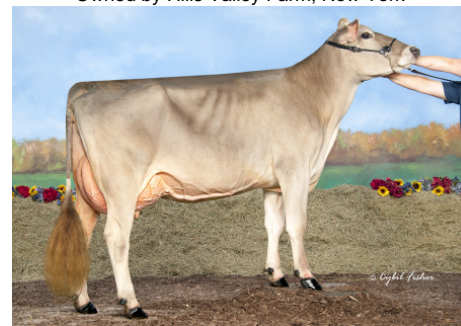
Cutting Edge D Neema Reserve Intermediate Champion Northeast All Breeds Show 2020 Owned by Edge-View Genetics, NY & KY