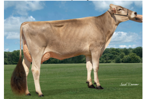
Hilltop Acres Silver Kadence Bred and Owned by Hilltop Acres, IA