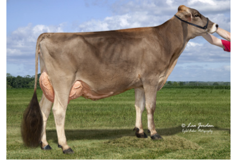
VB Silver Zora Bred and Owned by Voegeli Farms, WI