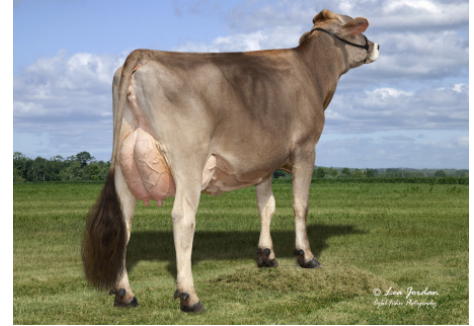
VB Silver Zora Bred and Owned by Voegeli Farms, WI