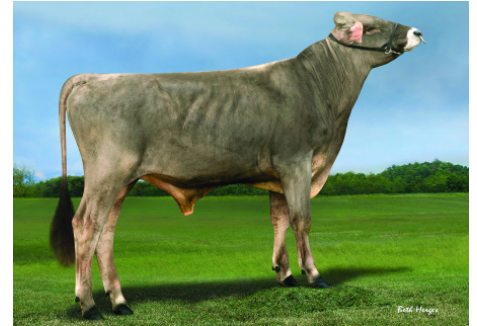
54BS577 La Rainbow Sweet Silver ET