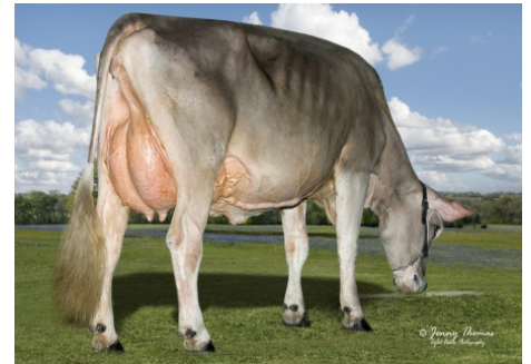
Dam: La Rainbow Sweet Silk ETV 'E91 E 91 MS' 2nd Lactation Photo