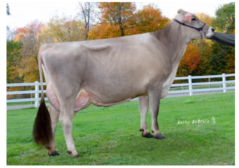
RNR Silver Panera