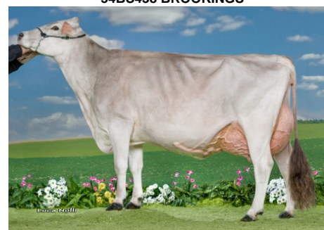
Pedri Brookings Bookie Best Udder Italian National Show 2018